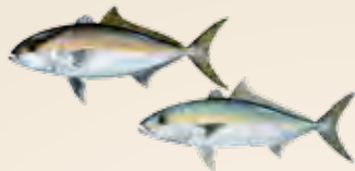
Amberjack, Lesser & Banded Rudderfish ▲●